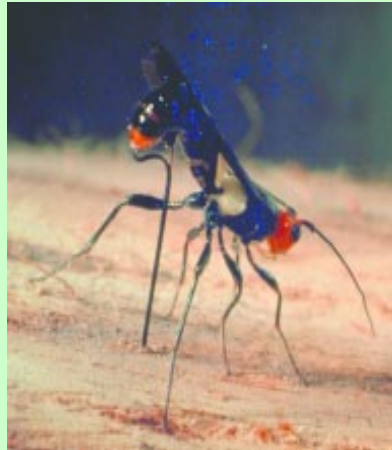
Parasitoid S. lepidus parasitizing eucalyptus borer larva.