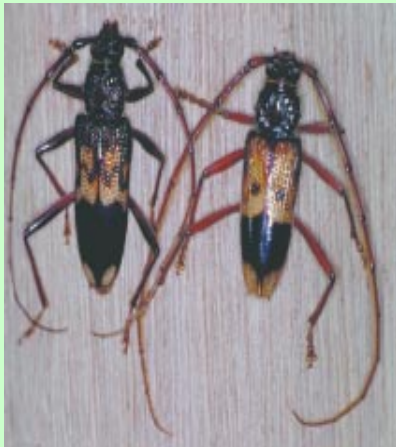
Eucalyptus borers P. semipunctata (left) and P. recurva (right).