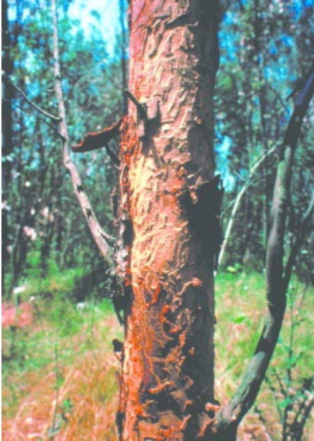
Eucalyptus killed by eucalyptus borers.